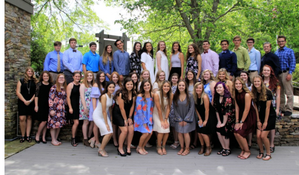
Some of the Chapel's scholarship recipients

All students will be interviewed by a member of the Scholarship Committee.